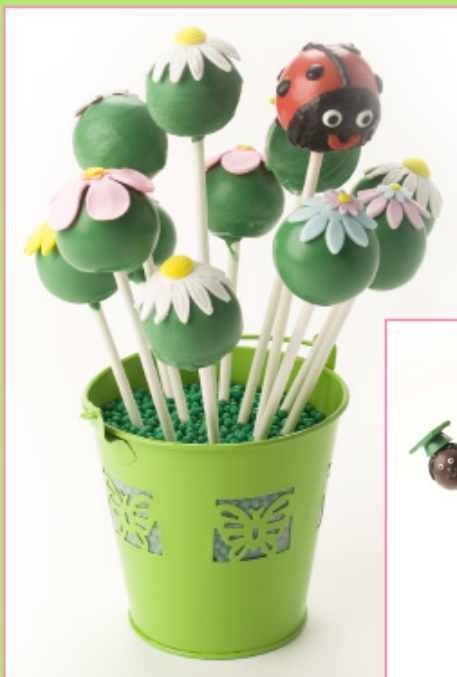
Idea Gallery # 1252

Instructions: 1. Prepare cake balls. Chill in refrigerator at least 2 hours. It is best to work with only a few cake balls at a time while leaving the rest in refrigerator. 2. Dip one end of sucker stick into melted candy coating and insert into cake ball. 3. Let set completely. 4. Dip cake pops in melted green candy coating and place in sucker stand to dry (for the ladybug, dip into melted red coating). Allow to dry completely before adding details. 5. Using a black candy writer, pipe a half circle for the ladybug's face; add eyes. 6. With the black, draw lines down center of the back and add dots. Pipe a smile using red coating in a parchment cone. 7. Cut various colors of daisies and blossoms out of fondant and attach to cake pops with melted chocolate. 8. Arrange pops in tin with candy clay in bottom. Cover with candy pearls.