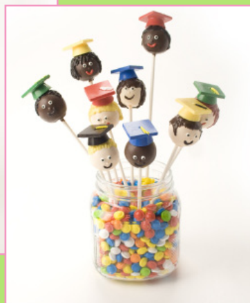
Idea Gallery # 1251